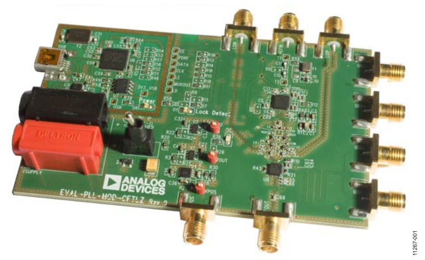
Figure 1. EVAL-CN0285-EB1Z