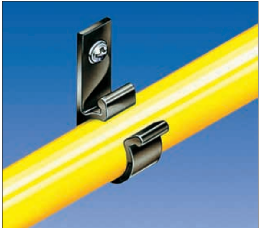
The clip is held in place by a screw and the bundled cable or pipe is guided securely.

Screwed D-clips are available in 3 sizes and guarantee time and cost saving by simply pressing the cable into the holder. The flexible grip means that later removal or replacement of cables and pipes is possible. 3 different bore diameters for fixing the holder are available