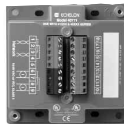
Type 1 Base Plate — Front View

A front panel bar code with the model, revision, and two removable Neuron® ID stickers is provided. When placed on the building or system design plans, these stickers can save installation time, especially for inaccessible devices.