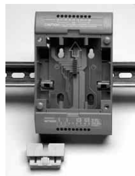
Type 1D DIN Base Plate