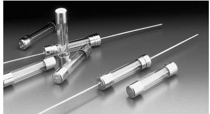
312 000 Series